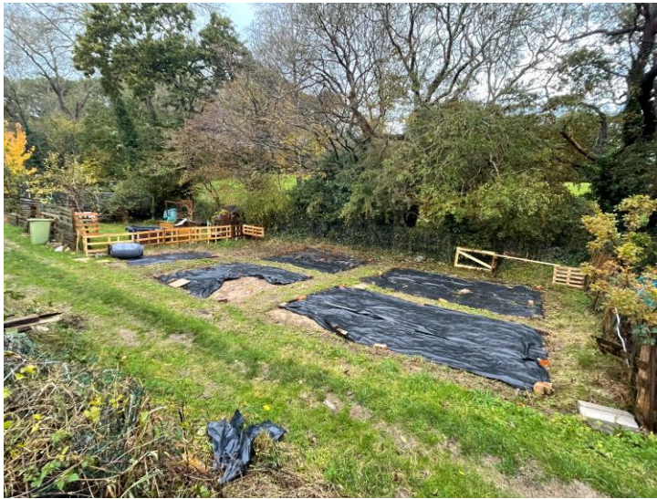
Clearance of Bexhill CIC Allotment site area