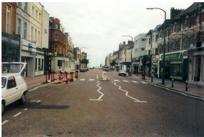
View of Devonshire Road. Facing South from Devonshire Square.

Other Factors One-way road (West to East) Bus routes (Double Decker)