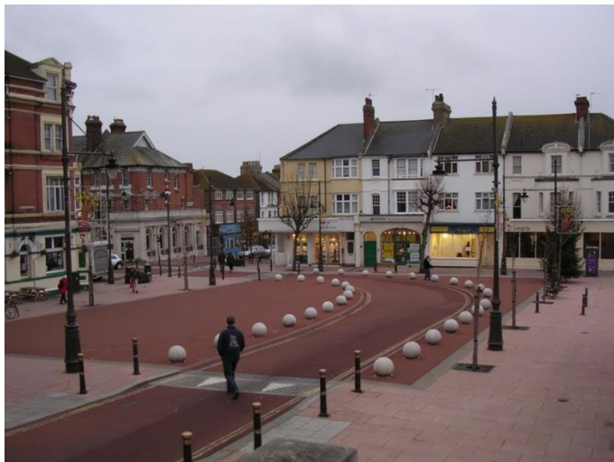
View of Devonshire Square. TN40 1AB Seen from the East

Desired requirements Decorated Christmas Tree Lights on trees Lamppost decorations