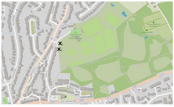
LITTLE COMMON REC notice boards. Location(s) marked with X